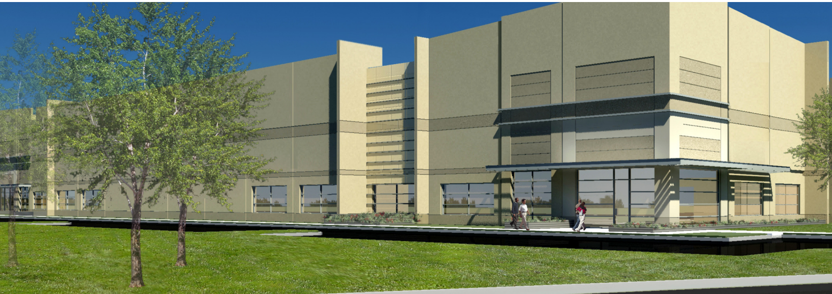
Lakeview Business Park in Houston, Texas is a 240,889 sf, LEED® pre-certified industrial building.