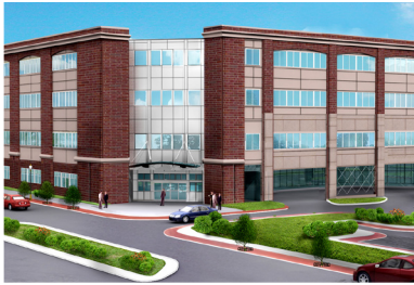
Bryn Mawr Medical Pavilion is a 147,000 sf, LEED® pre-certified medical office development located in Bryn Mawr, Pennsylvania.