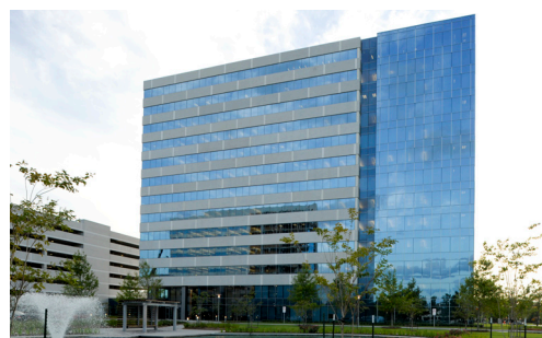
Left: Discovery Tower, in the central business district of Houston, Texas, is more than 850,000 sf, LEED® Gold pre-certified Class A office building; above, Energy Center I, a 332,000 sf, LEED® certified office development located within Houston’s Energy Corridor.

value for our clients and lead to long-term, real world business solutions that keep us all reaching for a greener tomorrow.