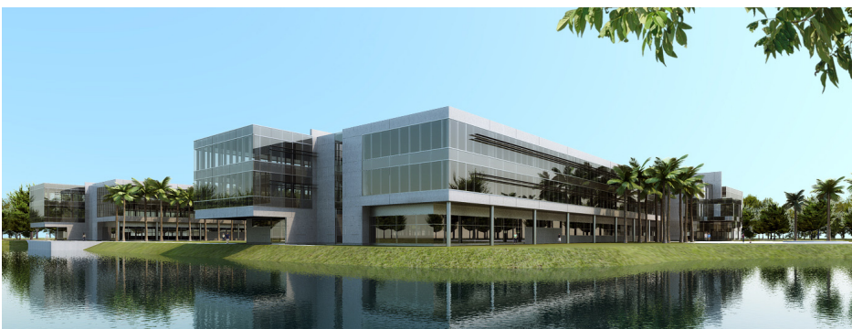
Darden Restaurants HQ is a 465,000 sf, sustainable office development located in North Florida.