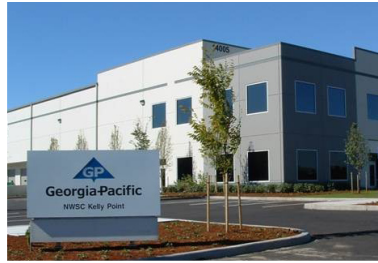
Rivergate Corporate Center III is a 575,000 sf, LEED® Silver pre-certified industrial development located in Portland, Oregon.

AS A REAL ESTATE DEVELOPER, Trammell Crow Company has insight into how the design and use of commercial buildings impacts the environment.